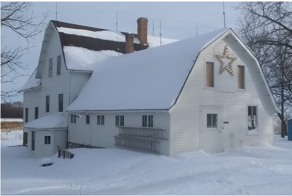
Honey House; NW Elevation.