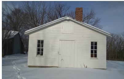
Wax Shed; South Elevation