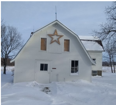
Honey House; West Elevation, west wing. Painting completed, windows installed winter/spring 2023