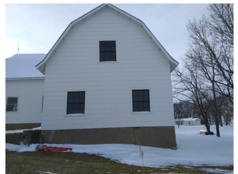
Honey House; East Elevation painting complete, restored windows installed. Siding repaired and painted.