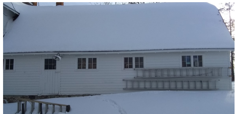
Honey House; North Elevation , West wing. Painting complete, restored windows installed, will be glazed spring 2023