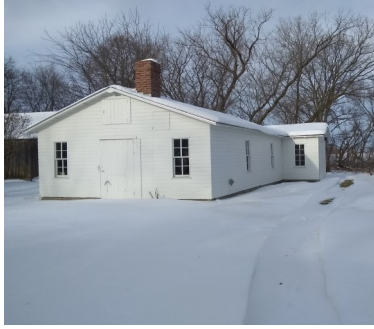
Hofmann Apiaries Wax Shed; exterior painting completed October 2022. South Elevation.