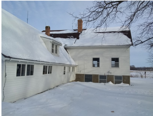
Honey House; West Elevation, south wing. Siding repaired, painting completed. Window reinstallation winter/spring 2023