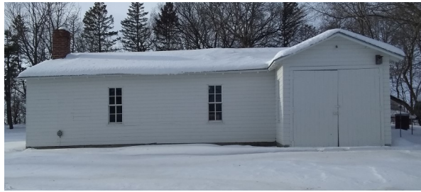
Wax Shed; East Elevation

Wax Shed Exterior restoration completed November 2022. Interior rafter/ truss repair will commence and be completed Winter 2023.