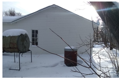
Wax Shed; North Elevation