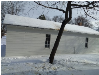
Wax Shed; West Elevation

Wax Shed Exterior restoration completed November 2022. Interior rafter/ truss repair will commence and be completed Winter 2023.