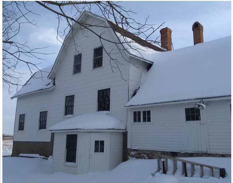
Honey House; North Elevation . Siding repaired and painting complete.